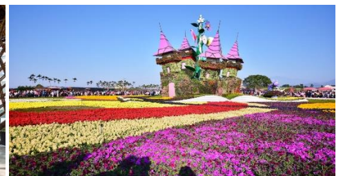
Taichung Flower Land