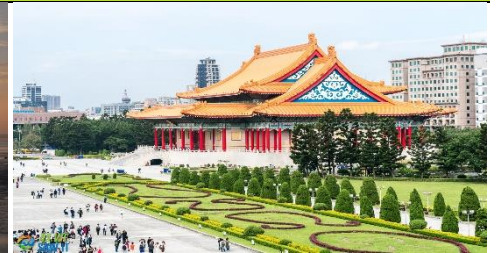
Chaing Kai Shek Memorial Hall