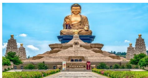
Buddha Statue Kaohsiung