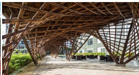
Vinata Bamboo Pavilion